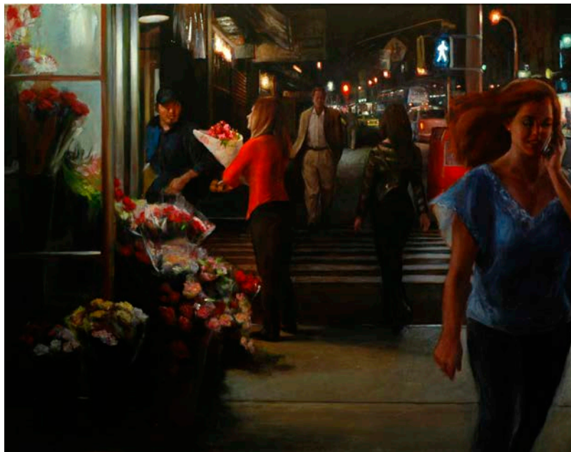
↑ Passing Glance , oil on linen, 36" x 46", 2012